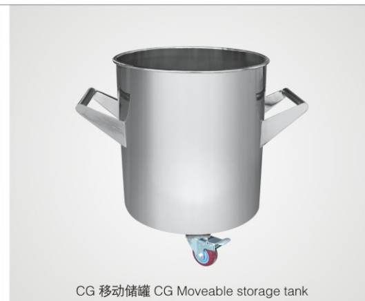
CG 移动储罐 CG Moveable storage tank

CG不锈钢储罐是一个存储容器用于化妆品、制药、食品和化学工业中的液体、半固体和固体的保存。它通常由一个不锈钢罐和配件等组成，有开口式和真空式等结构。