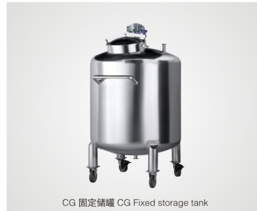
CG 固定储罐 CG Fixed storage tank