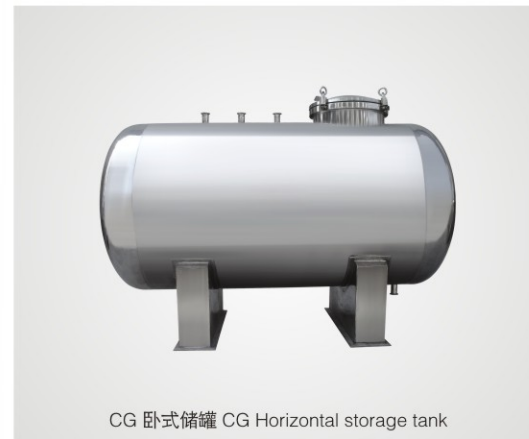
CG 卧式储罐 CG Horizontal storage tank